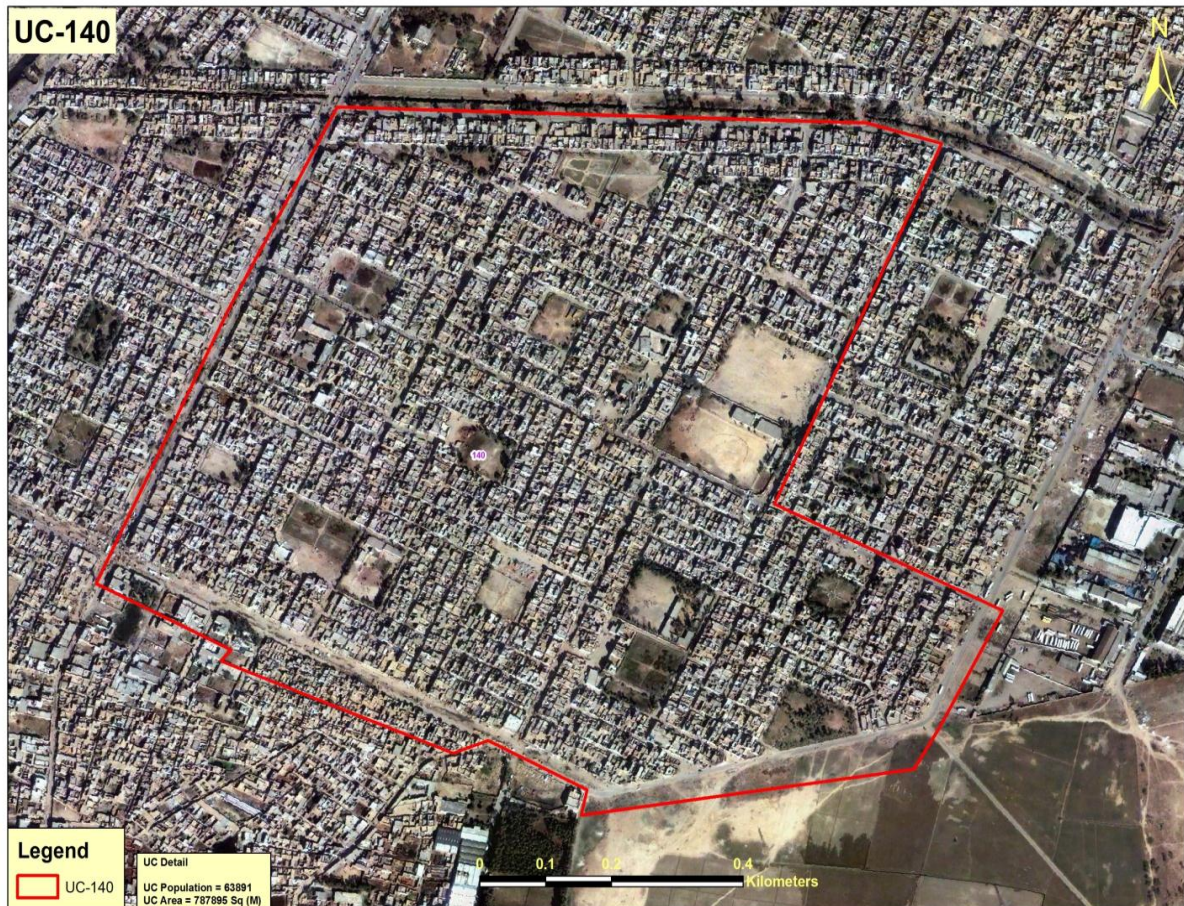
Figure 1: Map of UC 140 Maryam Colony

Union Council – 140 (Maryam Colony) is located in Nishtar Town. Total area of the UC is 787895 m 2 with population of 63891. This area is predominantly middle income area with planned settlement.